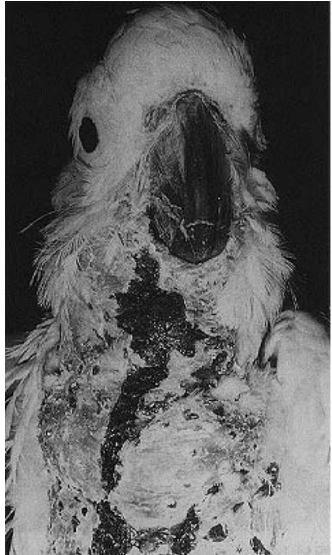
FIG 4.5 Some cases of psychological feather picking can progress to the point of self-mutilation.

Screaming is a serious behavioral problem, especially in cockatoos and macaws. The time of day and circumstances associated with screaming should be charted for several weeks in order to arrange training or play sessions for the time just before the