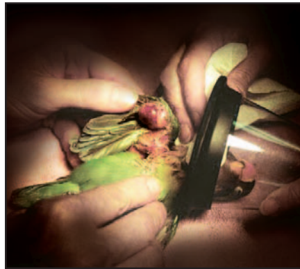
Fig 20.1.4 | Fibrosarcoma on the wing of a lovebird.