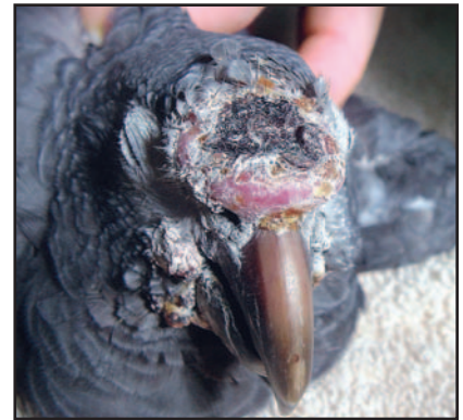
Fig 20.1.5 | Squamous cell carcinoma of the ramphotheca, and papillomatosis in an older Timneh grey parrot.

Fibrosarcomas may be subcutaneous or more deeply located in underlying tissue, and often appear fixed and proliferative with a nodular, red surface. They tend to be locally invasive and often recur with conservative surgical excision. Therefore, additional local treatment in the form of radiation therapy is often indicated for providing long-term local control. As the metastatic rate in other domestic species ranges from 5 to 15%, local disease management is paramount, with metastatic control as a secondary concern. Surgical excision followed by both radiation and chemotherapy has been reported with some success in a few publications. 14 Strontium radiation therapy, although limited by depth of penetration, has been anecdotally reported as efficacious in several instances. 35