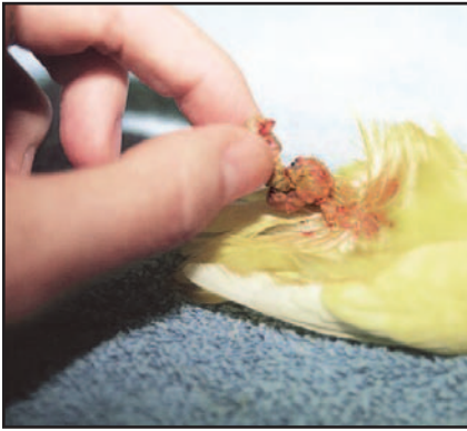
Fig 20.1.6 | Chondroma on the leg of a budgerigar.