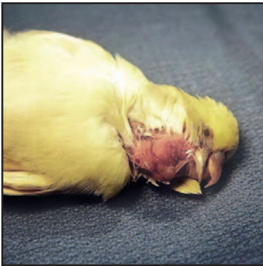
Fig 20.1.3 | Fibrosarcoma on the face of a budgerigar.