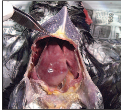
Fig 20.1.10 | Retrobulbar lymphoma in a young African grey.