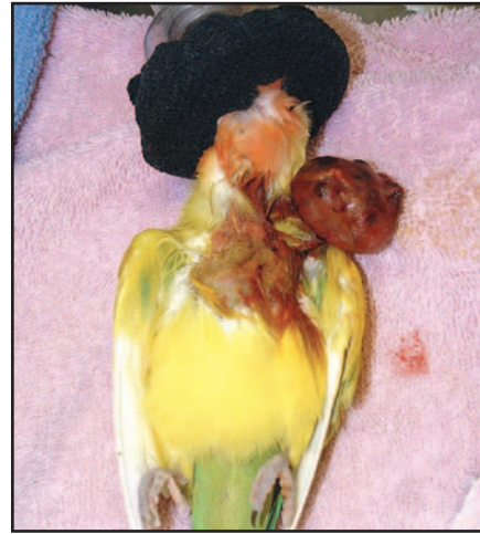
Fig 20.1.9 | Thymoma in a lovebird, intraoperatively.

These have been documented in multiple avian species, but are most prevalent in budgerigars and cockatiels. Affected animals may present with acute neurologic conditions (seizures/opisthotonos). They also may present