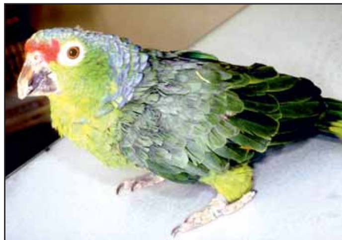
An Amazon parrot exhibits typical external clinical signs of malnutrition, specifically relating to the integument. In addition to the scuffy feathers, it is obvious that the beak has been trimmed due to overgrowth.