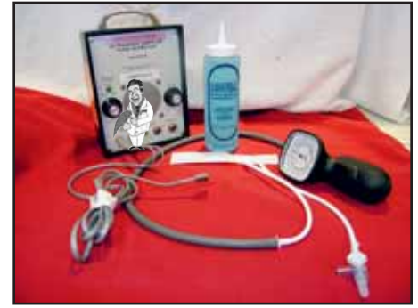
Fig 1. Indirect Doppler pressure apparatus: Doppler blood pressure monitor with the attached probe and the Doppler pressure cuff with attached sphygmomanometer are shown. The Doppler blood pressure gel is used to enhance contact of the probe to the skin.