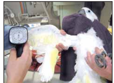
Fig 2. The sphygmomanometer is attached to the cuff. The cuff is inflated to suprasystolic Doppler blood pressure sounds and released slowly. The first sound heard is the systolic blood pressure.