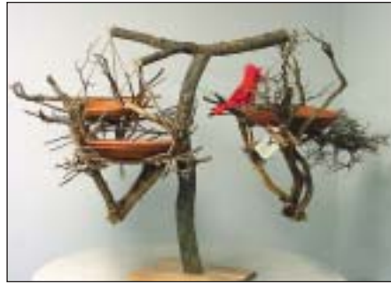
Special handmade bird feeders, such as these with natural branches, are available from HBD International for offering organic seeds or water to backyard birds.

One solution to upgrade what is fed at backyard feeders is to offer organic seeds. Wild Wings Organic Wild Bird Foods are