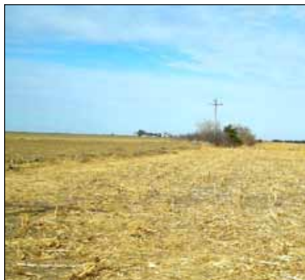
The chronic use of Roundup and genetically modified seeds results in hard, dry, unhealthy soil.

University of Wisconsin-Madison, Departments of Agronomy, Entomology, and Plant Pathology, at www.plantpath.wisc.edu/soyhealth