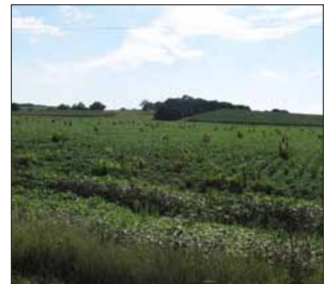
Because Roundup Ready corn was planted the previous year, volunteer stalks show up in a soybean field treated with Roundup, making expensive hand removal necessary.