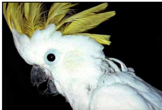
Cockatoos are among the most commonly abandoned pet birds.

problems — screaming, biting, other aggression — on the part of the bird.