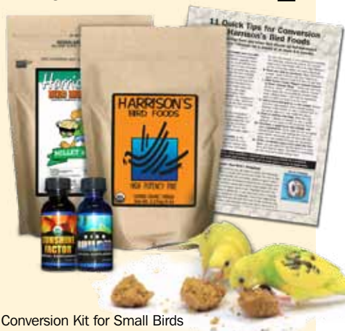
Conversion Kit for Small Birds

Practitioners have found these kits convenient for the owners and effective in obtaining diet conversion results.