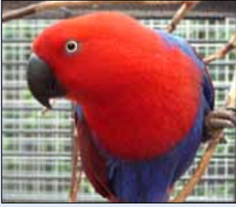
A female eclectus exhibits normal feathering.